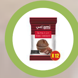
Double Chocolate Filled Pack of 12