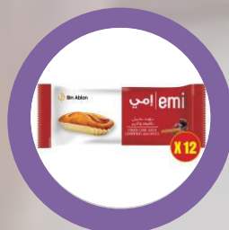
Pound With Cinnamon and Dates Pack of 12x55Gm