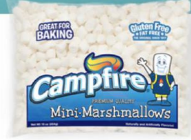
Mini White Marshmallows