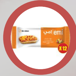
Pound With Fruits Pack of 12x55Gm