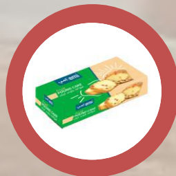
Family Pound Fruits 220Gm