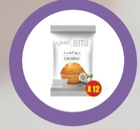
Coconut Pack of 12