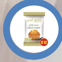
Vanilla Flavor Pack of 12