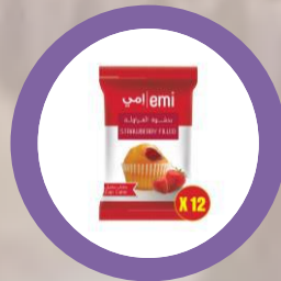
Strawberry Filled Pack of 12