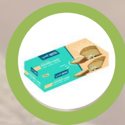
Family Pound Vanilla 220Gm