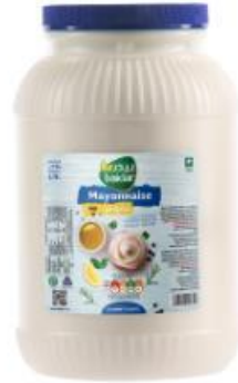
PIZZA SAUCE TOMATO KETCHUP MAYONNAISE