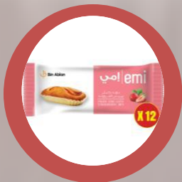
Pound Strawberry Jam Pack of 12x55Gm