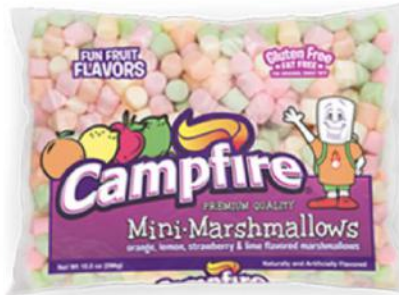
Mini Fruit Marshmallows