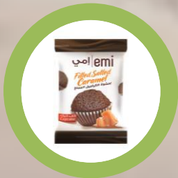
Choco Salted Caramel Filled Cupcake