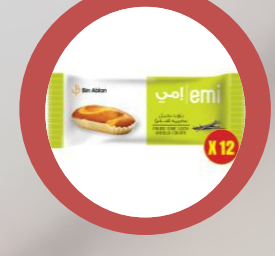
Pound With Vanilla Cream Pack of 12x55Gm