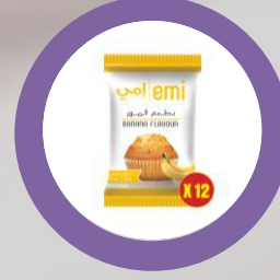
Banana Flavor Pack of 12