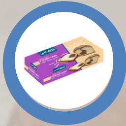
Family Pound Marble 220Gm